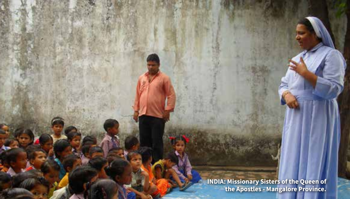
INDIA: Missionary Sisters of the Queen of the Apostles - Mangalore Province.

It is recommended to notify family and/or loved ones about the general contents of your Will. Providing for dependants and family will always come first, but good communication can help ensure the totality of your final wishes are carried out.