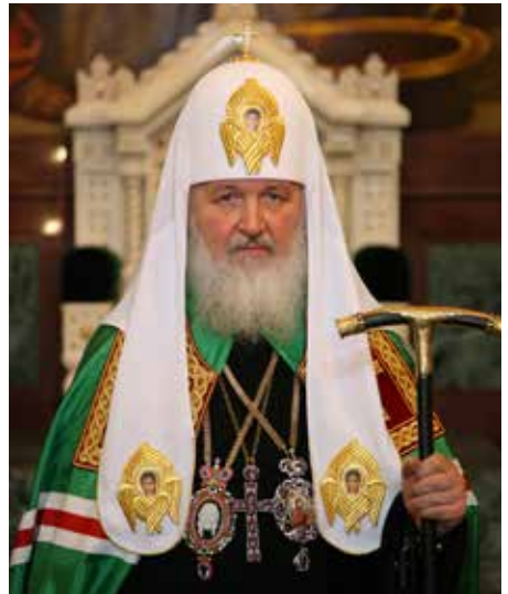
RUSSIA: Orthodox Patriarch Kirill of Moscow and all Russia

The hospice building in St. Petersburg is in need of extensive renovations. ACN is helping Father Aleksandr to continue his ministry with a donation of €30,000 for the building renovations. This work is only possible through the support of our benefactors.