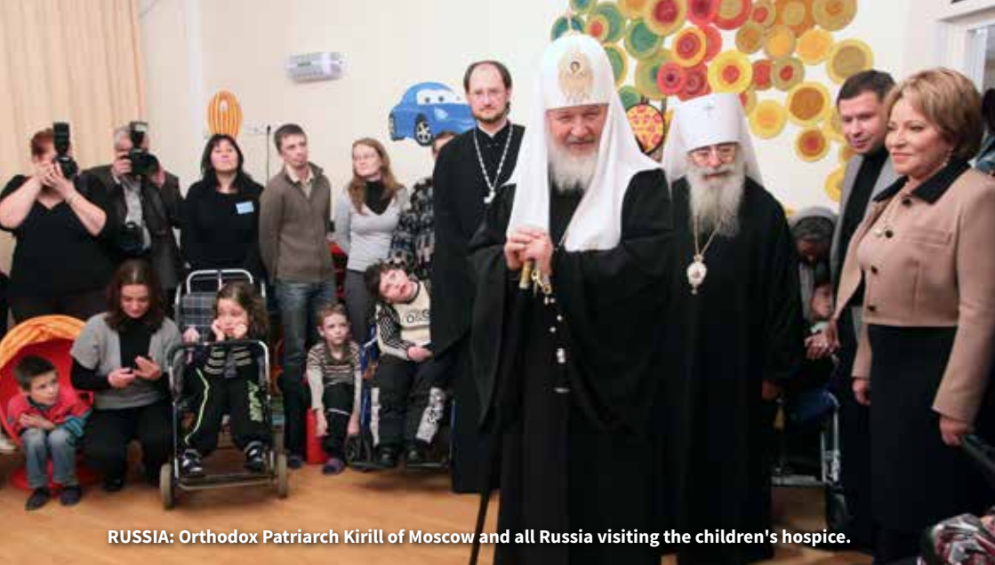
RUSSIA: Orthodox Patriarch Kirill of Moscow and all Russia visiting the children's hospice.