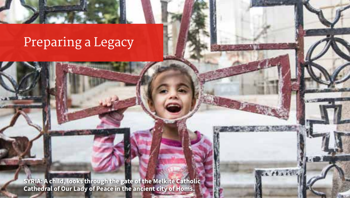
SYRIA: A child, looks through the gate of the Melkite Catholic Cathedral of Our Lady of Peace in the ancient city of Homs.

A legacy, also known as a bequest, is simply a gift left in one's Will to a person, or an organisation. The legacy comes out of the 'estate,' which is the total sum of a person's assets at their death. There are several types of legacies that can be chosen: