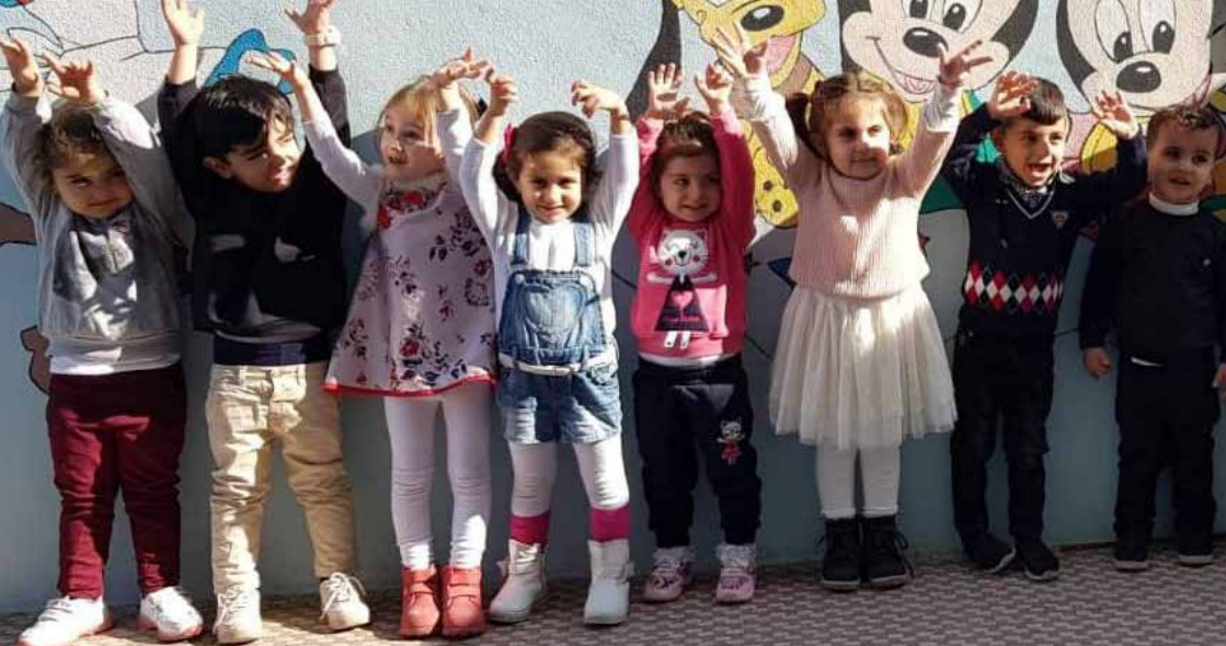
IRAQ: Finishing construction of partially damaged Holy Family Ephremite nursery Qaraqosh.

Iraq's Christian population is very young, with a high proportion of young families. Many young children have spent most of their lives as refugees. Socialising with other children is key to every child's development, with it being doubly important for children from displaced families.