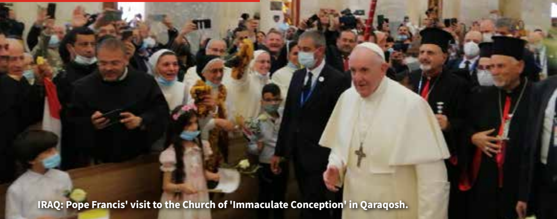
IRAQ: Pope Francis' visit to the Church of 'Immaculate Conception' in Qaraqosh.