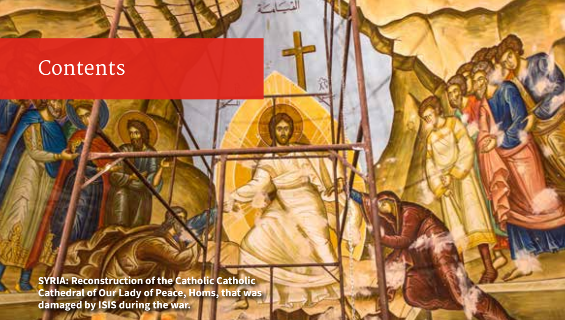
SYRIA: Reconstruction of the Catholic Cathedral of Our Lady of Peace, Homs, that was damaged by ISIS during the war.