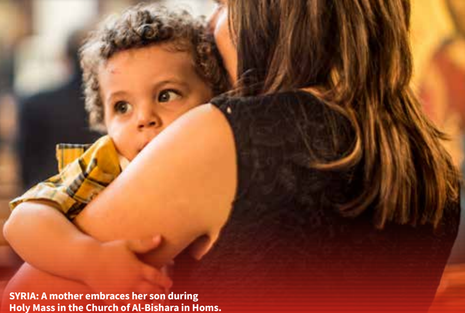
SYRIA: A mother embraces her son during Holy Mass in the Church of Al-Bishara in Homs.

You Legacy will help Save Lives, Save Souls and Save the Faith.