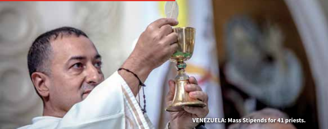
VENEZUELA: Mass Stipends for 41 priests.

If you are leaving a part, or all of your legacy, to Mass offerings, specify the number and type of Masses. You may choose to include your intentions, but this is not compulsory. God knows them and the priest offers each Mass for the intentions of the donor. An example of the suggested form of words is: