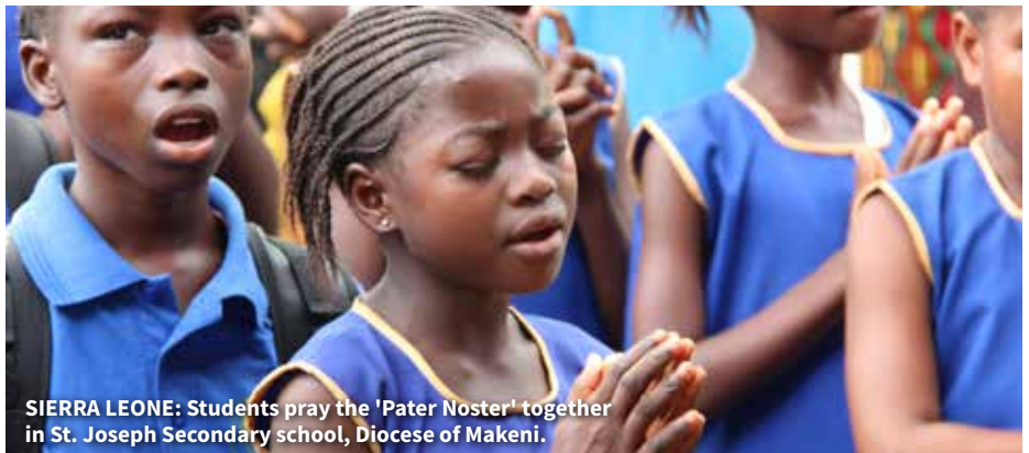
SIERRA LEONE: Students pray the 'Pater Noster' together in St. Joseph Secondary school, Diocese of Makeni.

Since the beginning of the twenty first century there have been at least 100,000 Christians killed each year for their Faith. Every month, 214 churches and associated properties are destroyed by violence, while at the same time 772 forms of violence are committed against Christians. It is conservatively estimated that 245 million Christians experience high levels of persecution for their Faith.